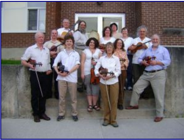
Celtic Heritage Fiddle Orchestra

Monday, Sept. 5 The Celtic Heritage Fiddle Orchestra will be playing at the main beach from 11 a.m. to 1 p.m. in conjunction with a Beach BBQ . The members of this group come from Perth and its surrounding communities and the orchestra is in its 11 th year. The fiddle orchestra plays Cape Breton styles (mostly Scottish), Irish and French tunes. This small orchestra consisting of fiddles, guitars, mandolins and penny whistles can encourage the joyous in your soul with a jig or reel or wring your heart with a ballad. Saturday, Sept. 10 Olde-Tyme Carnival with music, clowns and carnival games