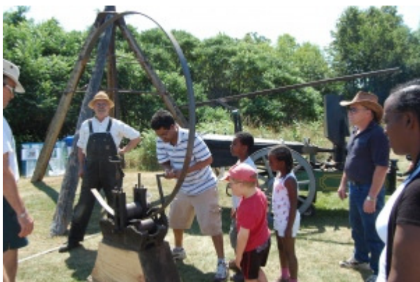
Blacksmith at Mica Festival