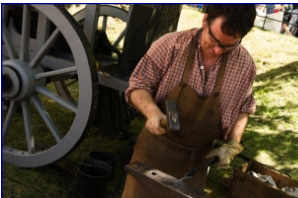
Parks Canada Blacksmith

Saturday, Aug. 27 The Lally Homestead Heritage Day will be held from 10 a.m. to 4 p.m. at the Lally Homestead site (approximately 2 km beyond the main park entrance). Come and spend a day enjoying displays of heritage trades and crafts, lots of old-tyme music and terrific food offerings. Watch the Parks Canada blacksmith ply his trade. Visit our lace-makers and admire their handiwork.