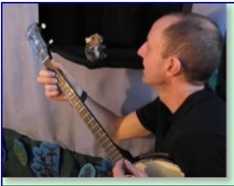
The Paddling Puppeteer

Sunday, Sept. 4 Freshwater Trade takes to the amphitheatre stage for a special festival concert beginning at 8 p.m. Doors open at 7:30 p.m. with costumed interpreters on hand to greet you as you arrive. Click here to learn more about Freshwater Trade.