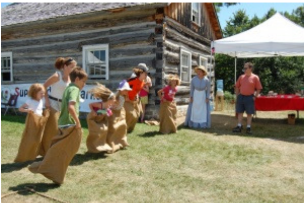
Children's heritage games at the Mica Festival

Saturday, Aug. 27 The Lally Homestead Heritage Day will be held from 10 a.m. to 4 p.m. at the Lally Homestead site (approximately 2 km beyond the main park entrance). Come and spend a day enjoying displays of heritage trades and crafts, lots of old-tyme music and terrific food offerings. Watch the Parks Canada blacksmith ply his trade. Visit our lace-makers and admire their handiwork.