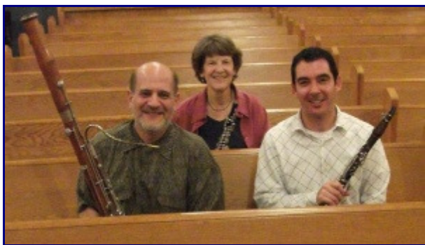
Tay Valley Winds